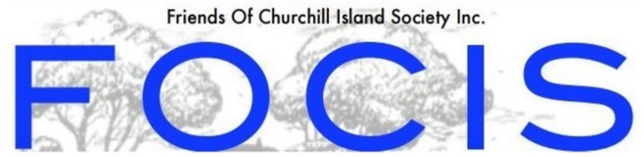
We acknowledge the Traditional Owners of the land on which we live