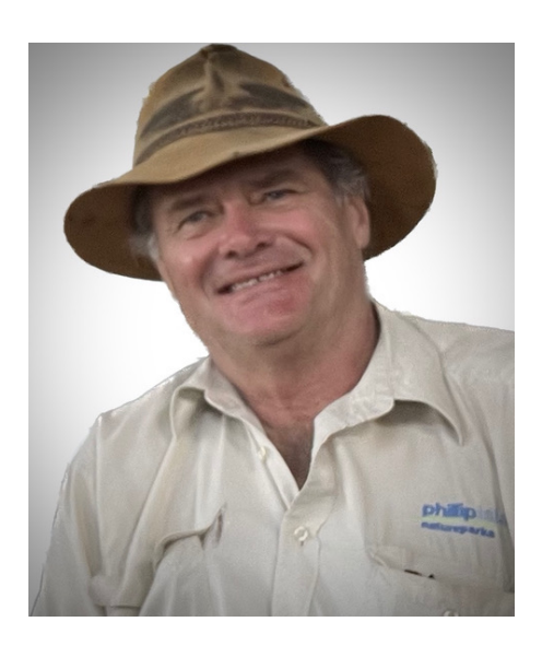
G'Day Focis Members

Just a short report this time around. Mainly to let you know that Easter was a big success at Churchill Island! There were lots of activities on offer and it was great to see so many volunteers out and about. This was particularly pleasing as the weather was extremely wet and cold. It was also fantastic to see the introduction of horse and wagon rides. They were very popular with visitors.