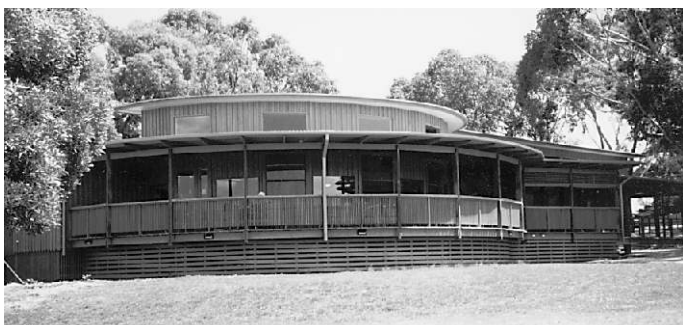
New Churchill Island Visitor Centre